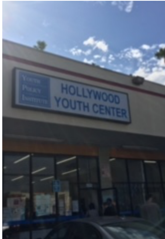
East Hollywood Youth Center in a strip mall next to food pantry and WIC office