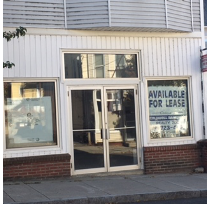
Store front on corner Maple Street and Central Ave. Great location for a FRC to help the families in the most effected neighborhoods in Naugatuck